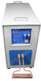
Three Phase 380V 30kW High Frequency Induction Welding Machine