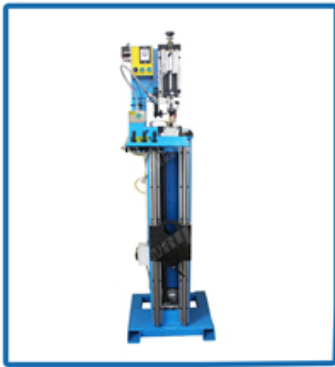
Brazing Machine Welding Rack