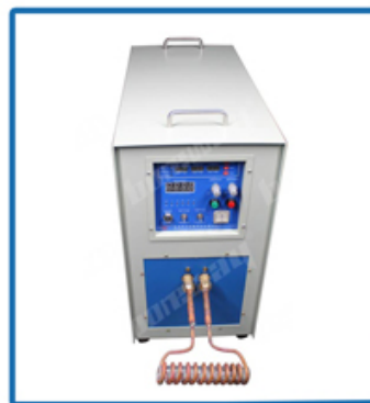
Three Phase 380V 30kW High Frequency Induction Welding Machine