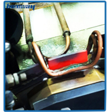
Welding segment effect