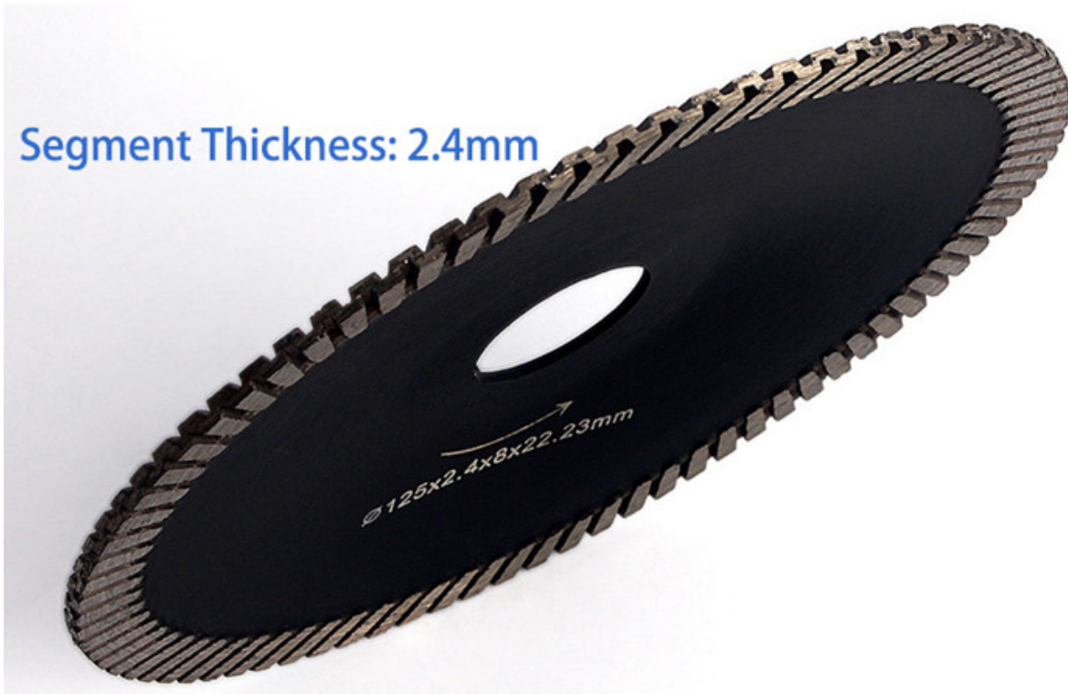
5 Inch Concave Diamond Cutting Blade