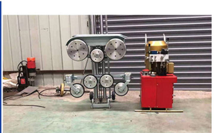
Hydraulic Wire Saw Cutting Machine