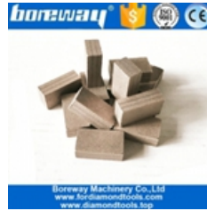
Marble Block Cutting Segment