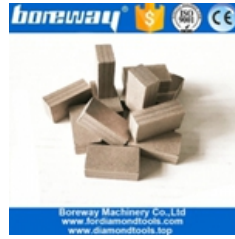
Marble Block Cutting Segment