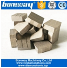
Granite Block Cutting Segment