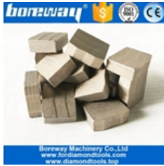
Granite Block Cutting Segment