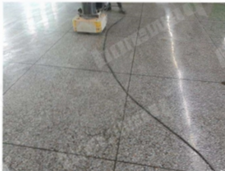
Before Grinding and Polishing