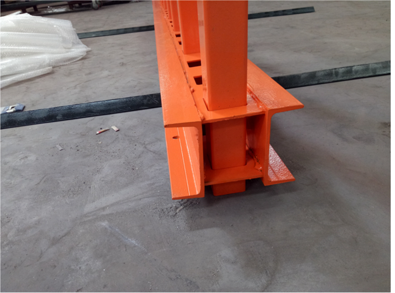
Packing & delivery