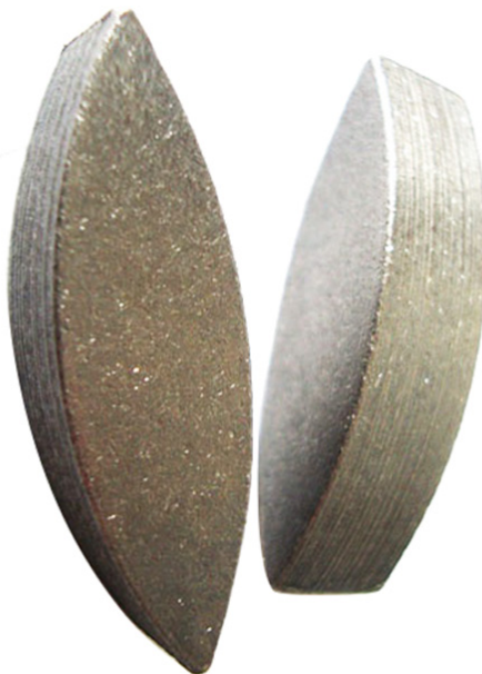
Oval Shape Diamond Abrasive Segment

Oval Sharp Segment For HTC Trapezoid Pad is use welding on the grinding disc or htc grinding tools for grinding concrete floor.