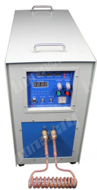
Three Phase 380V 30kW High Frequency Induction Welding Machine