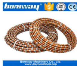
Portable Abrasive Diamond Wire Saw