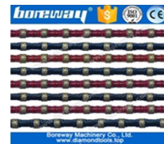
Diamond Saw Hire