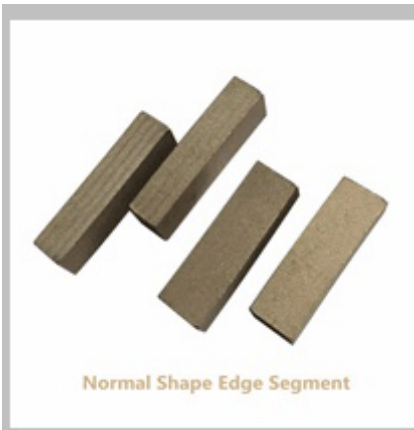
Normal Shape Edge Segment