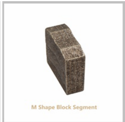
M Shape Block Segment