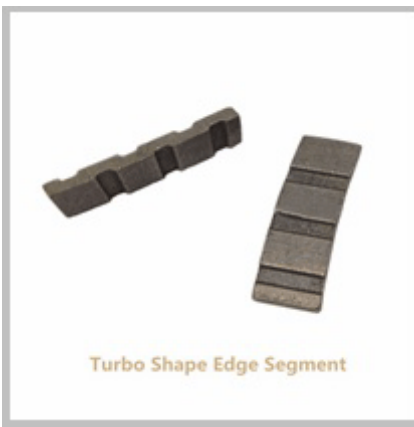
Turbo Shape Edge Segment