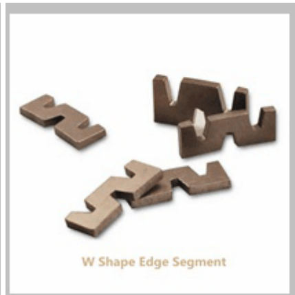
W Shape Edge Segment