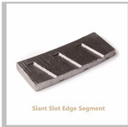
Slant Slot Edge Segment