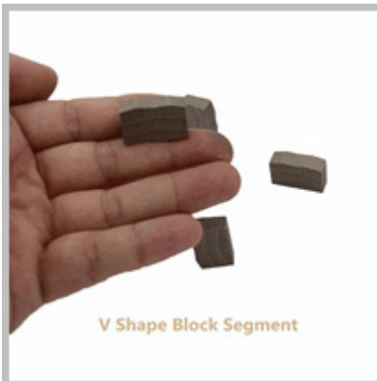
V Shape Block Segment