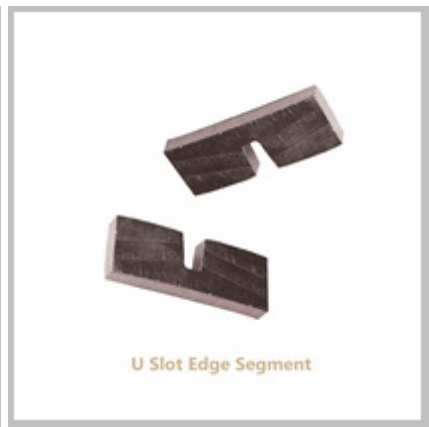
U Slot Edge Segment