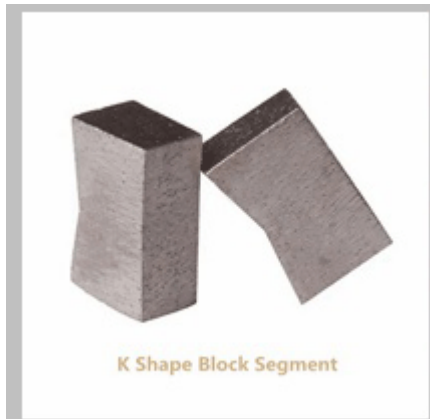
K Shape Block Segment