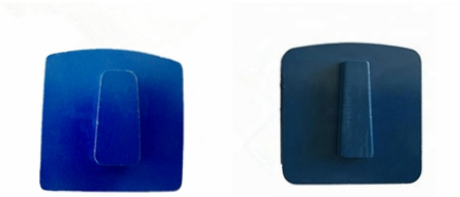
Husqvarna Redi Lock Blank Scanmaskin Blank