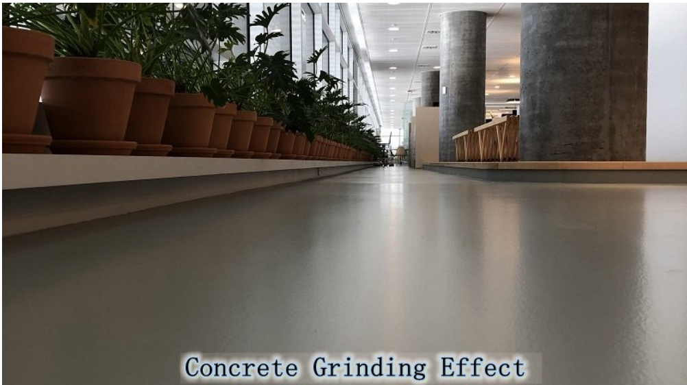
Concrete Grinding Effect